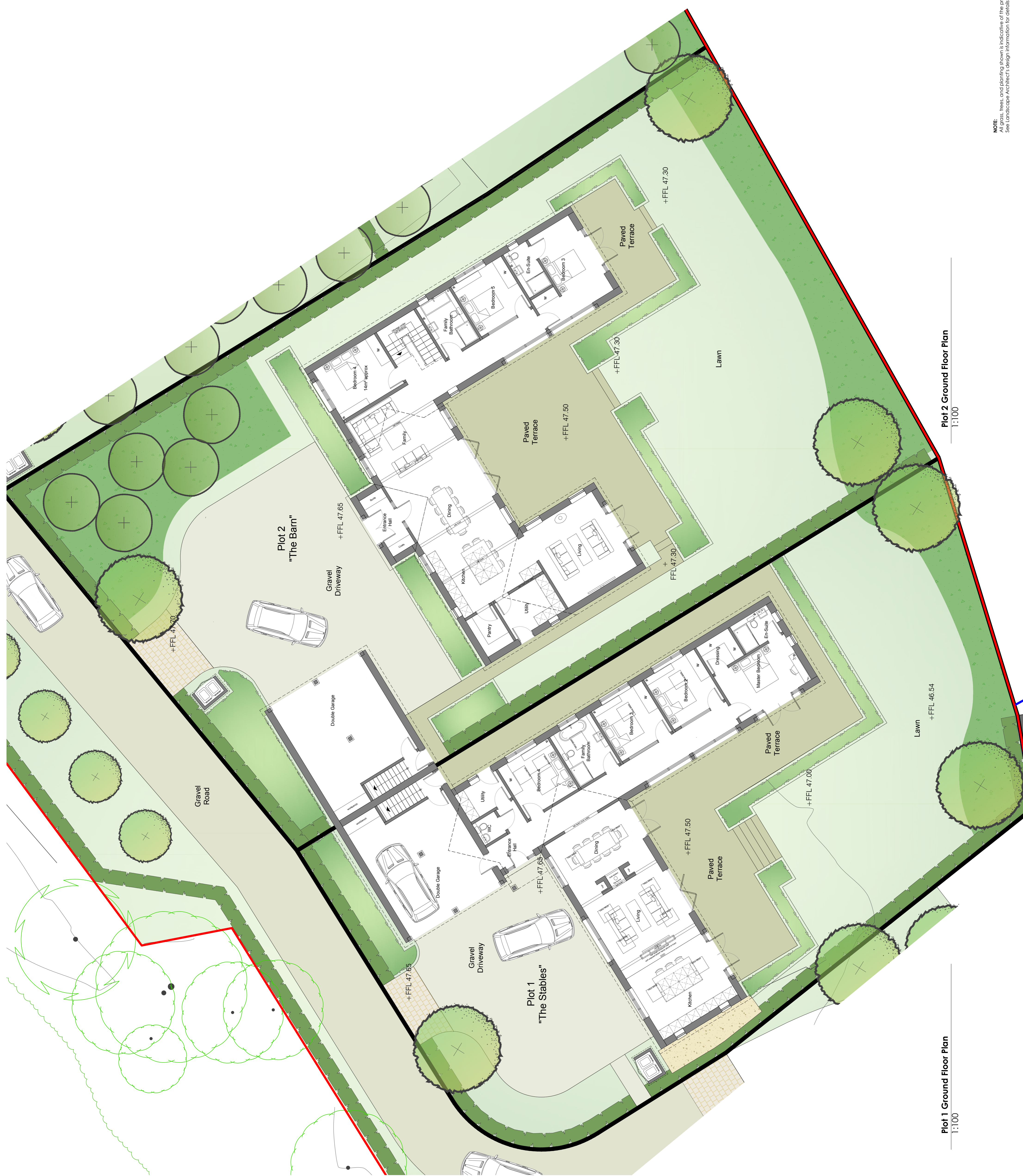
Plot 1 Ground Floor Plan 1:100

The drawings to be used in conjunction with drawings and reports from: Indigo Landscape Architects: 10465-01 Supplementary Landscape Information: 10465-S-2022-12-12